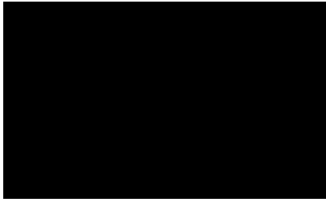
Fig. 1. Annual per capita visitation to the various U.S. and international public lands in this study. Included were U.S. National Parks (variable NPV, range of time series 1939–2006, n = 68 ), U.S. State Parks (SPV, 1950–2003, n = 24 ), U.S. National Forests (NFV, 1939–2002, n = 61 ), U.S. Bureau of Land Management sites (BLMV, 1982–2005, n = 20 ), Japanese National Parks (JapanNPV, 1950–2005, n = 56 ), and Spanish National Parks (SpainNPV, 1996–2006, n = 11 ). Linear regressions for declines from identifiable peaks in NPV (1987) and JapanNPV (1991) are represented by lines and equations.

supporting information (SI) Fig. 3. Fishing and Ducks both show downtrends. Although Hunting shows a high in 1983, a linear regression from 1983 to 2005 is insignificant ( P = 0.582 ).